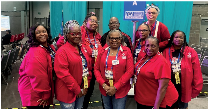
EBR, Caddo and Bogalusa Delegates