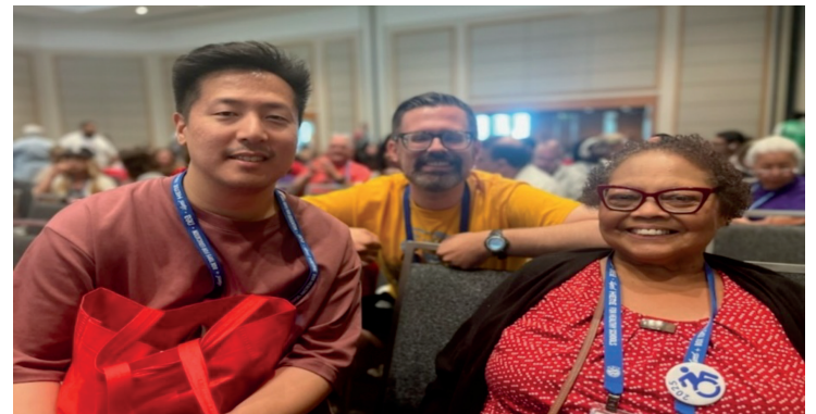
NEA RA Delegates representing California and Louisiana