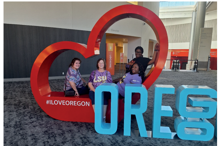
Caddo and EBR Delegates