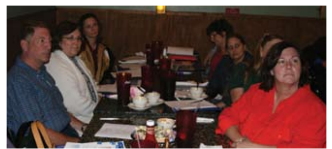
Concerned LAE members offer input at our Belle Chase meeting.