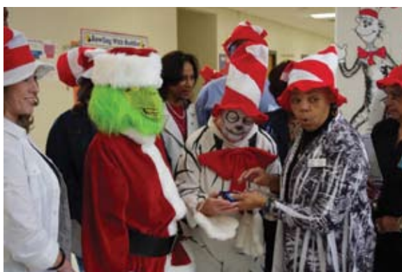
Winbourne Elementary School celebrates Read Across America Day!