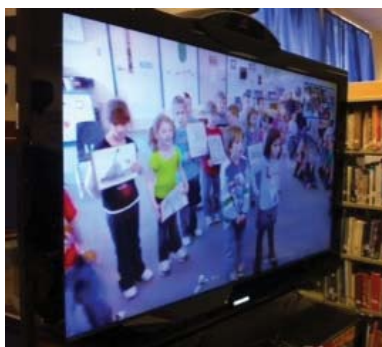
First graders in Tennessee "Rock the Seuss" with students at Avoyelles High School.

Avoyelles High School students celebrated Read Across America Day in a virtual way! The school hosted, "Avoyelles High School Rocks the Seuss From Coast-to-Coast", a live video conference where students read and performed their own inter-