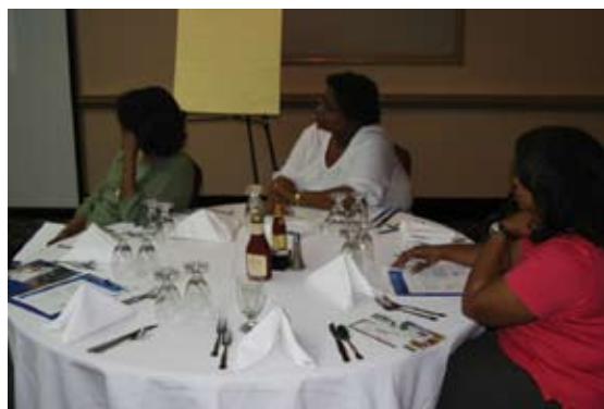
LAE members in Monroe learn about upcoming legislative issues.