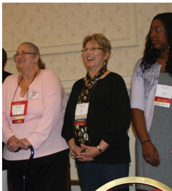
LAE Board members recognized on stage at the RA.