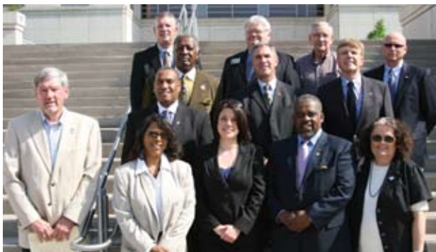
Members of the Coalition for Louisiana Public Education hold a press conference on the steps of the Louisiana Department of Education.

Among the focus areas, the Coalition wants the legislature to delay the implementation of letter grades for schools and to recognize that poverty often drives whether a school is successful. Coalition