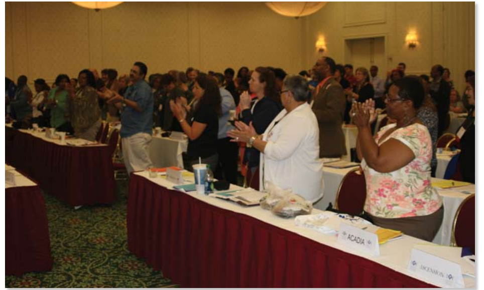
LAE delegates "stand up for public education."