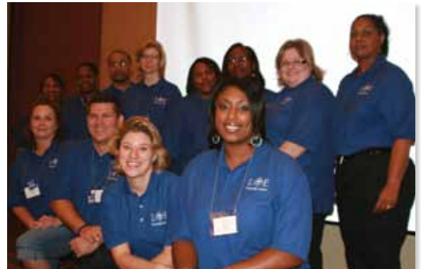
Congrats to the 2011 Emerging Leader class!