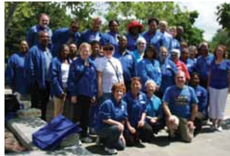
Lobby Day attendees gather for a photo outside the Louisiana State Capitol.

Thanks to all of you who joined us! We hope that you will be inspired to continue to let your voices be heard. Please sign up for LAE's advocacy system Capwiz, and keep an eye out for action alerts. We continuously take action on any governmental policies that will effect public education even if the legislature is not in session.