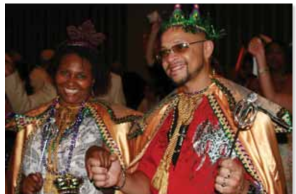
The 2011 RA Mardi Gras King and Queen reign over the party.