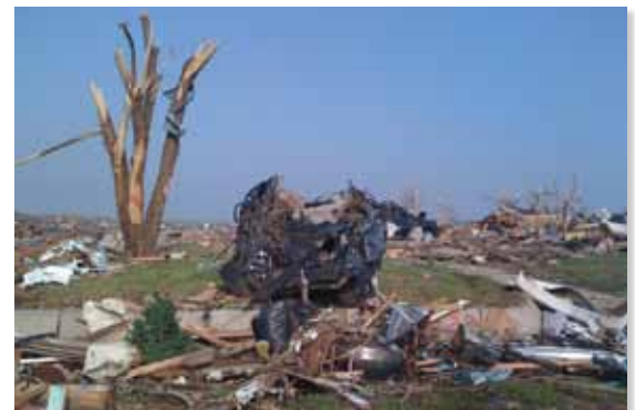
Tornado damage in Joplin, Missouri.