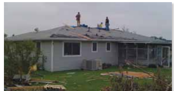
Volunteers repair home damaged by the devastating tornadoes that blew through the area this Spring.