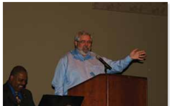
Keynote Speaker David Cay Johnston shocks conference attendees with his findings on government spending.