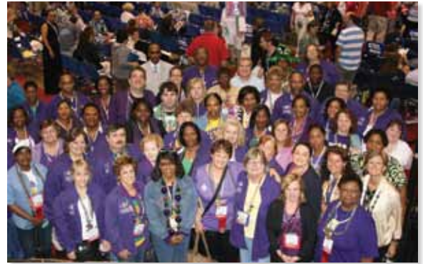
LAE delegates at the 2011 NEA Representative Assembly.